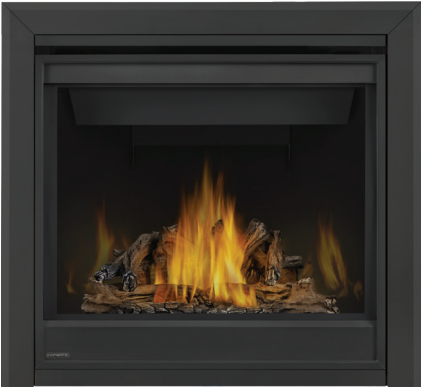
3" Premium Bevelled Trim