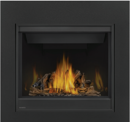
Clean Face Front